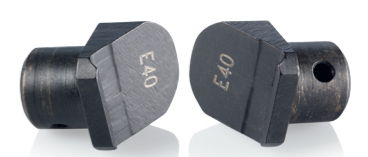
insert ILT E40