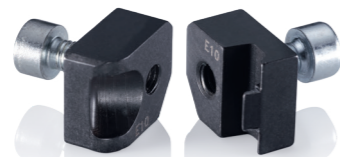
insert E10 for gripping tool